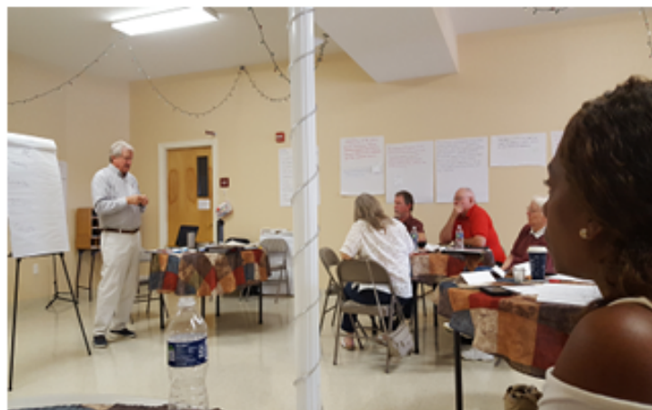
Board Members at Kingsway Strategic Planning Meeting 2021

Kingsway is going through many changes the last couple of years. Volunteers have changed and the needs of the ministry have changed. More funds are needed for re-entry because the needs are greater in this area. Kingsway is also planning for leadership change in the future. Transitions are part of the changes that must be considered. These times require great consideration of all aspects of Kingsway Outreach. The hard places we have experienced the last couple of years have become stepping stones and monuments of divine and heavenly things.